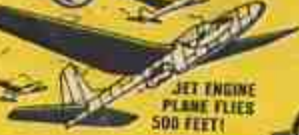
JET ENGINE PLANE FLIES 500 FEET!